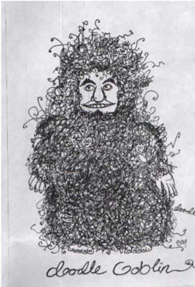
BY: BAILEY MARSHALL