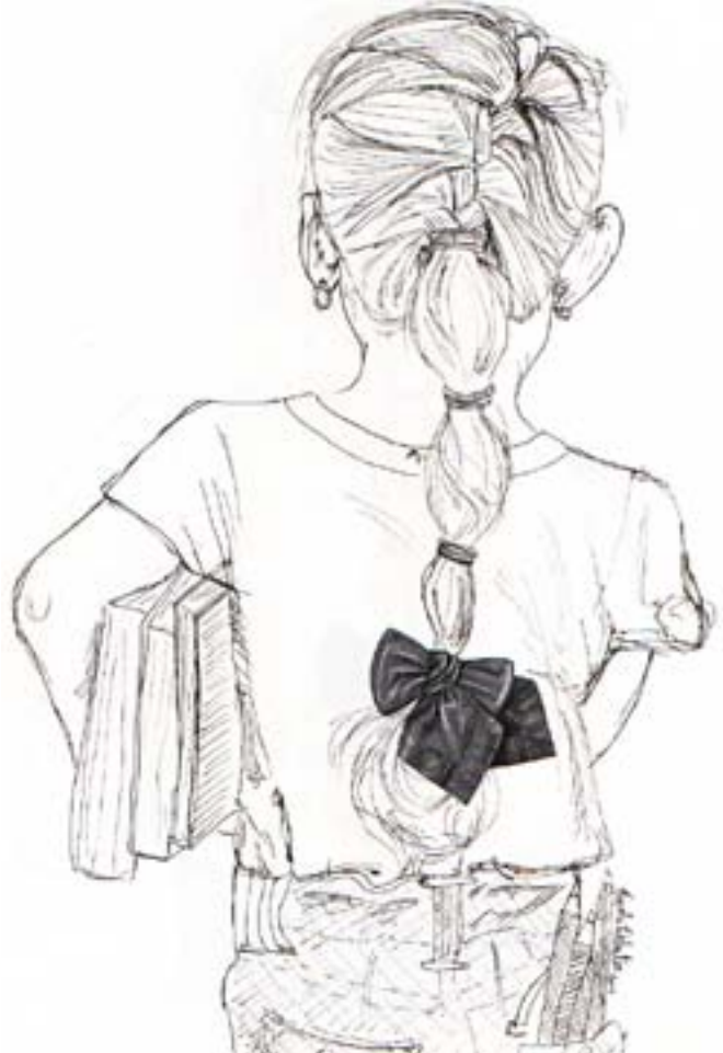
BY: NICOLE WEBSTER